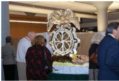
Ice Sculpture at Reception